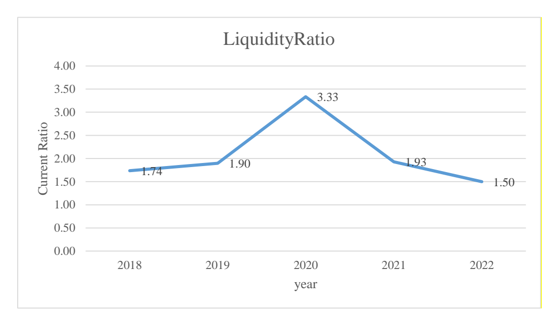
Figure 4.2 Liquidity Ratio

The results showed that in the year 2018, public universities based in Mount Kenya had an average current ratio of 1.99. The average liquidity increased to 2.99 in the year 2019 However, from the year 2020 to the year 2022, the current ratio continued to decline. The average liquidity in the year 2020 declined to 2.25 and further declined to 1.43 in the year 2021. In the year 2022, the liquidity ratio was at 1.01. The decline in liquidity was a clear indication of poor financial performance of the universities.