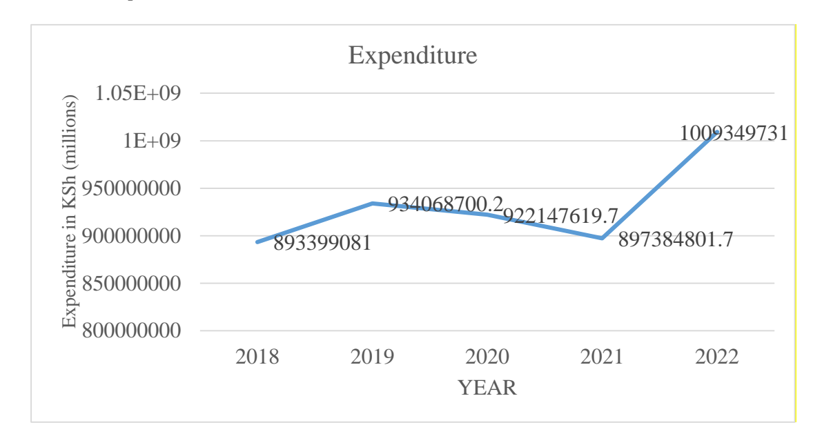
Figure 4.2 Trends on expenditure

The results showed that in the year 2018, universities in Mount Kenya region had an average expenditure of KSh 893,399,081. This expenditure increased to KSh 934,068,700 in the year 2019 but declined to KSh 922,147,619 and further declined to KSh 897,384,801 in the year 2021. The average expenditure however increased to KSh 1,009,349,731 in the year 2022. The decline in expenditure in the year 2021 and 2021 was mainly attributed to COVID 19 pandemic.