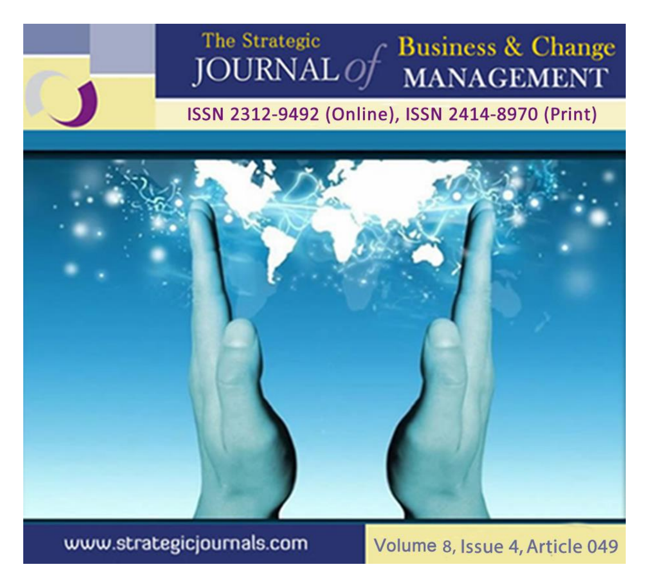
INFLUENCE OF CUSTOMER SERVICE STRATEGIES ON ORGANISATIONAL PERFORMANCE AMONG PRIVATE UNIVERSITIES IN KENYA