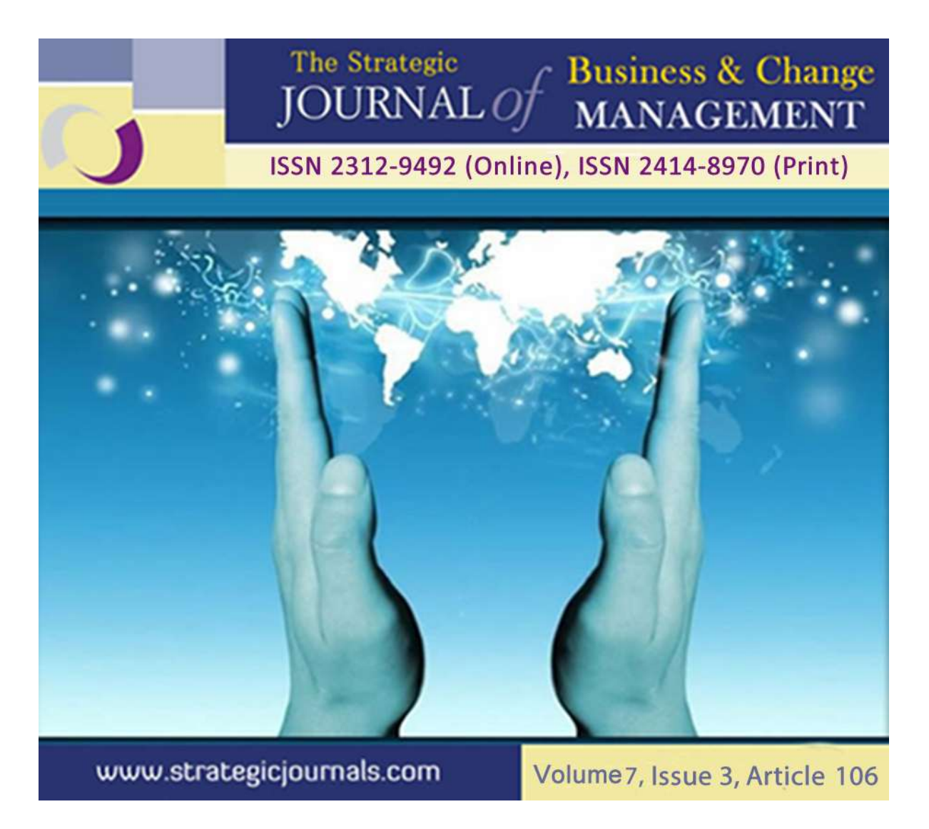
INFLUENCE OF ACCESS TO FINANCE ON WOMEN PARTICIPATION IN ENTREPRENEURIAL ACTIVITIES IN MURANG'A COUNTY, KENYA